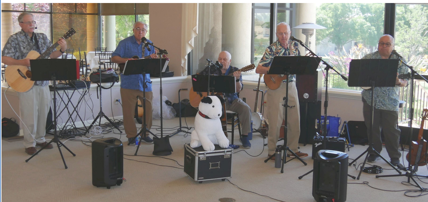
No Strings Attached, our Mothers Day entertainment