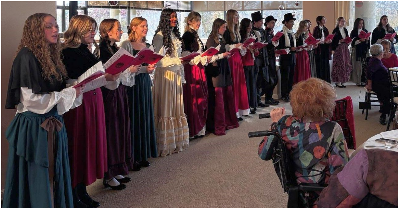
Liberty High School Choir